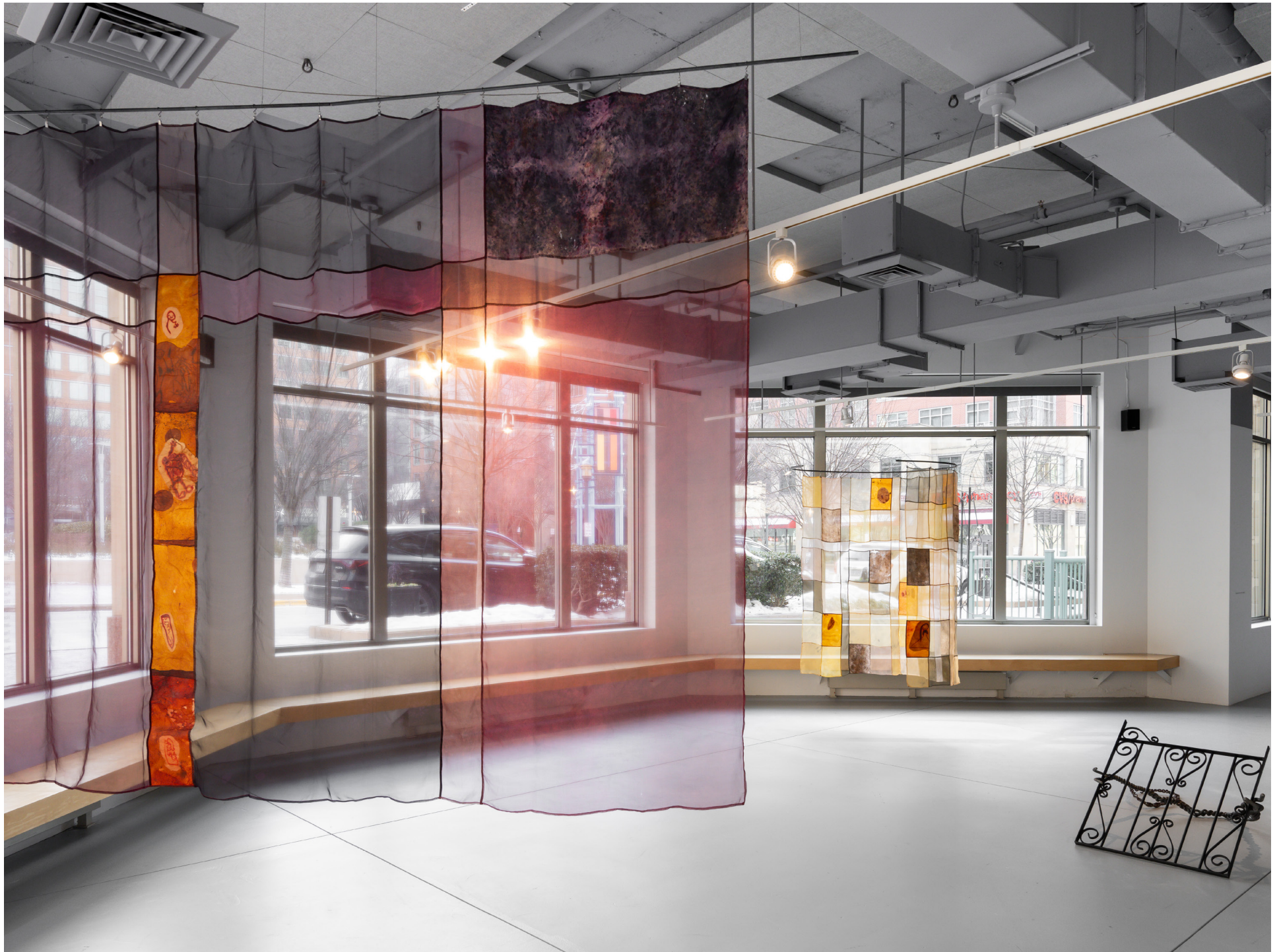
Installation view of MATRICULTURE , 2025